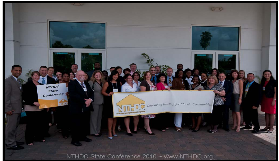
NTHDC State Conference 2010 ~ www.NTHDC.org

The NTHDC Team would like to wish you and yours a very happy holiday season. I know we all will have numerous challenges to face in the upcoming year, but I am hopeful that 2012 will be a great year for everyone. I am thankful that NTHDC is still serving as your PBCA for Florida and we have expanded our services to the U.S. Virgin Islands. HUD intends to bid the PBCA contracts again in early 2012, so we will be working very hard to ensure NTHDC will be here to serve your needs in the years to come. The funding outlook for affordable housing is concerning, but our industry will continue to find creative ways to serve those in need by providing quality housing.